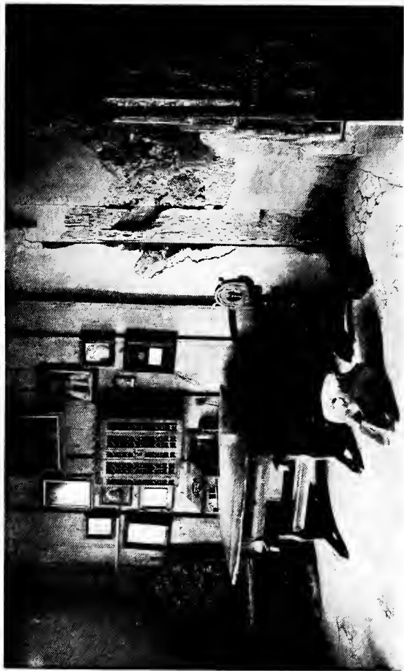
L UTHER'S ROOM at the Wartburg, where he lived from May 1521 to February 1522. The diamond-shaped hole in the wall has been cut by visitors. On it was originally a dark stain, said to have been caused by Luther throwing his inkstand at the devil.